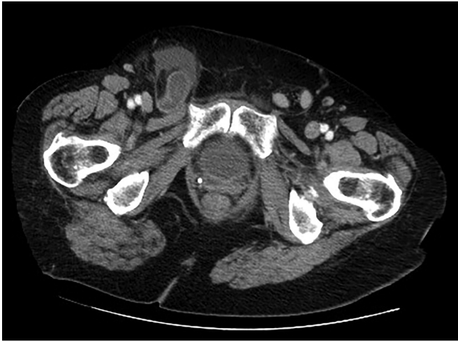
Figure 1. Computed Tomography scan demonstrating incarcerated femoral hernia containing small intestines.

and transected using an Endo GIA™ stapler. The appendix was completely intact and no spillage occurred. After inspecting the abdomen entirely, the abdomen was again desufflated. Completion of the femoral hernia in the preperitoneal spaced was performed. The mesh was not tacked in place. All ports were closed and covered with Dermabond®. The patient was discharged home the following day.