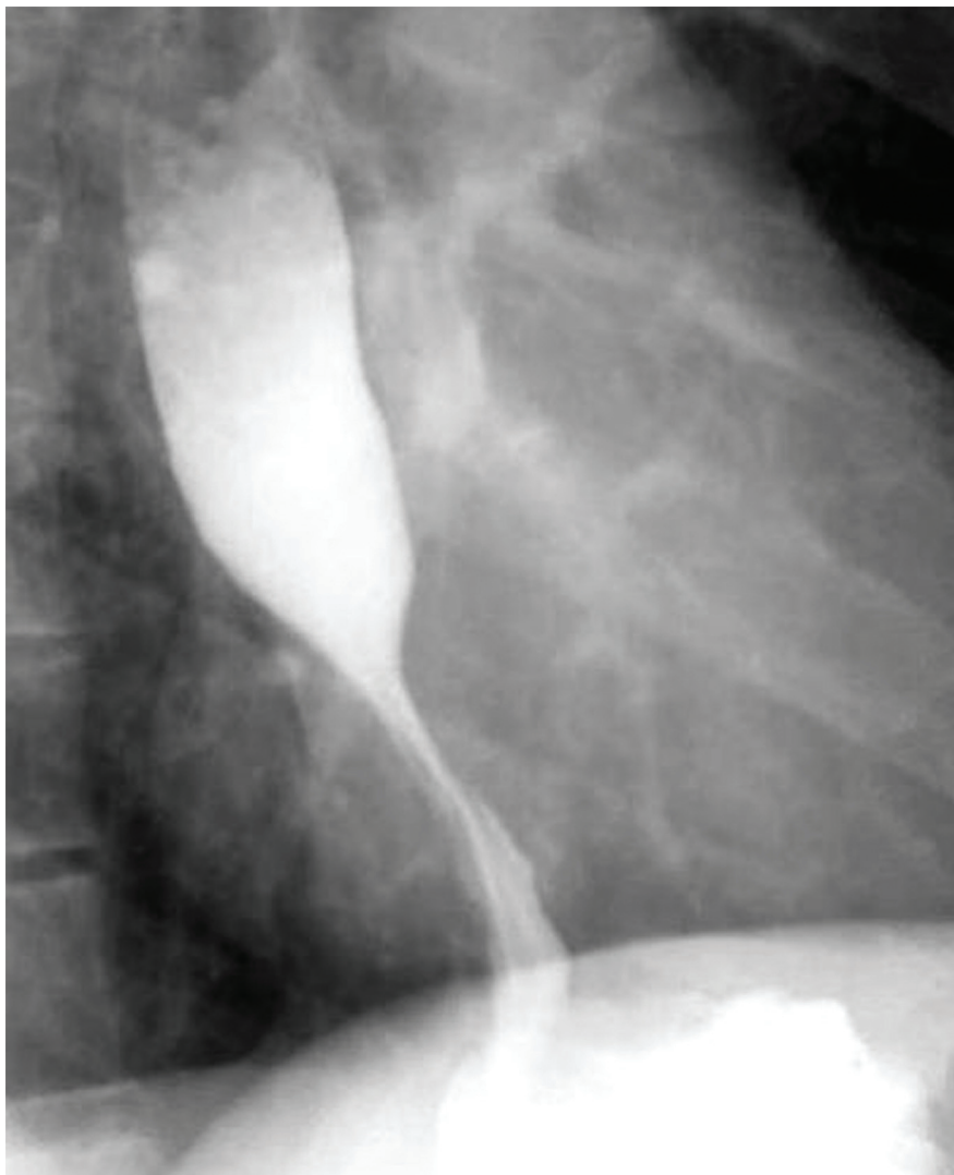
Figure 2. Pre-operative esophagram demonstrating distal esophageal narrowing at the level of the fundoplication.

was too tight. At this time, surgical intervention for possible revision of his prior fundoplication was planned.