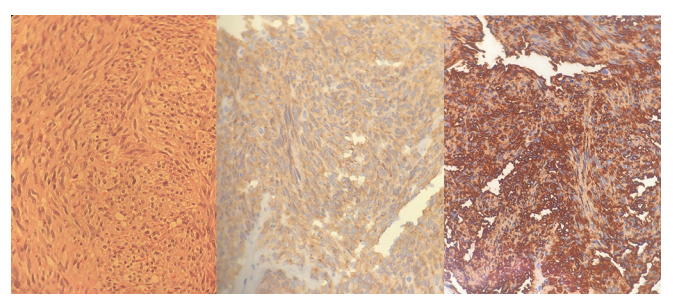
Figure 1. Fusocellular neoplasm with CD 34 and CD 117 markers positive respectively.

After diagnosis, she was referred to the oncology service and neoadjuvant chemotherapy with Imatinib was indicated for 9 months. After 6 months of treatment, a new CT scan of the thorax demonstrated regression of the lesion to 50 mm. After neoadjuvancy, she underwent robotic Ivor Lewis esophagectomy associated with jejunostomy. The abdominal and thoracic phases were performed by a robot. The patient's postoperative course was uncomplicated. Diet was introduced via jejunostomy from postoperative day (PD) 2, liquid oral diet in the PD 5, and pasty in the PD 6, the time of hospital discharge. On PD 14, the patient returned for follow-up without complications, on an exclusive oral diet without dysphagia. The patient remains in follow-up after 10 months of surgery with no